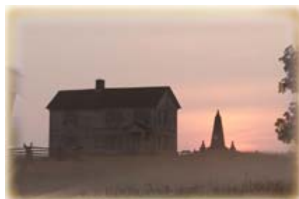
1861 First Battle of Manassas / Bull Run