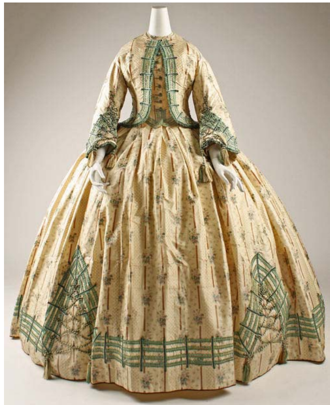
1862 Afternoon gown