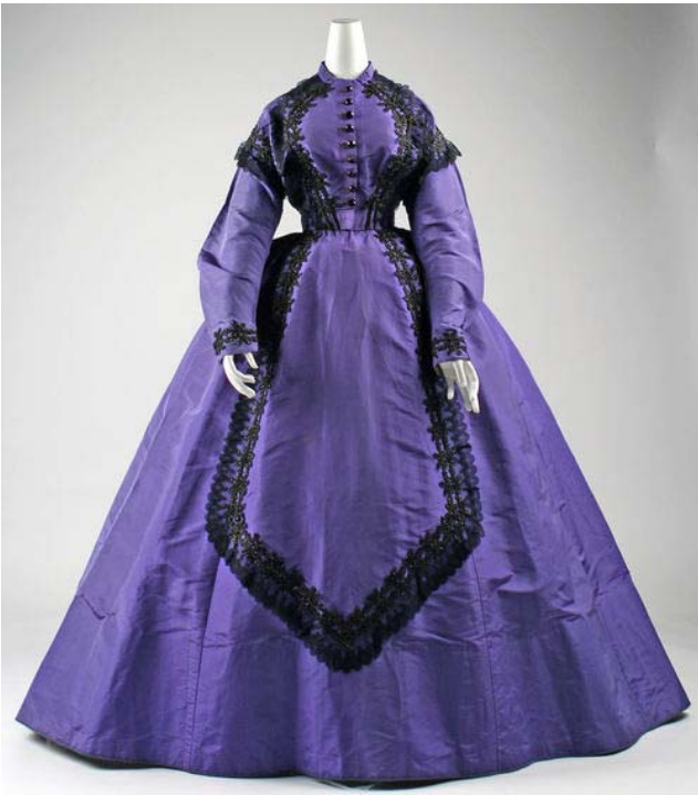
April 1865 Afternoon Gown